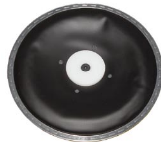
A-type Air Bearing